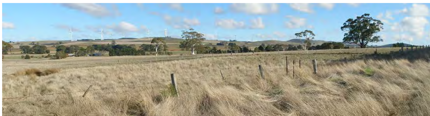
View from lower slopes of Mount Bolton to the Waubra Hills