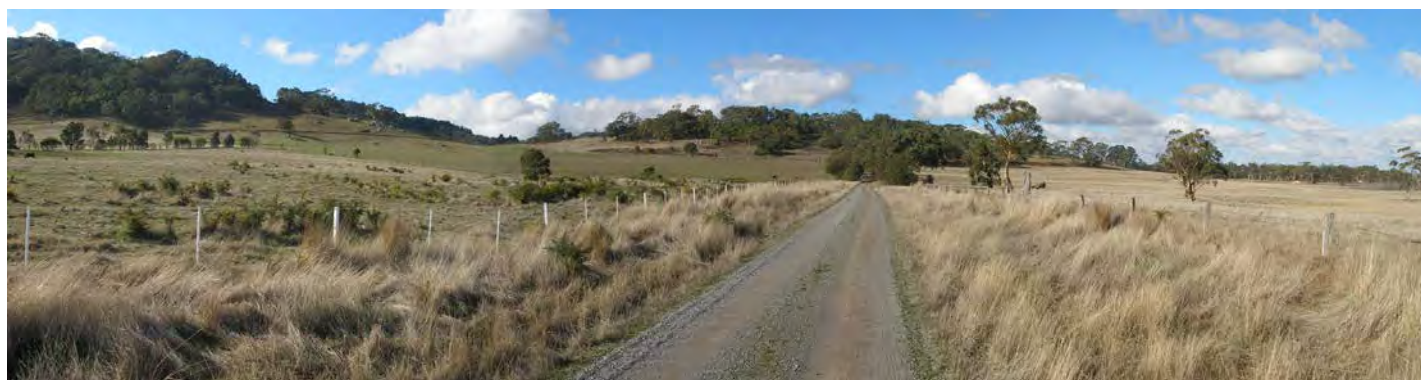
View of Mount Bolton Range Panorama